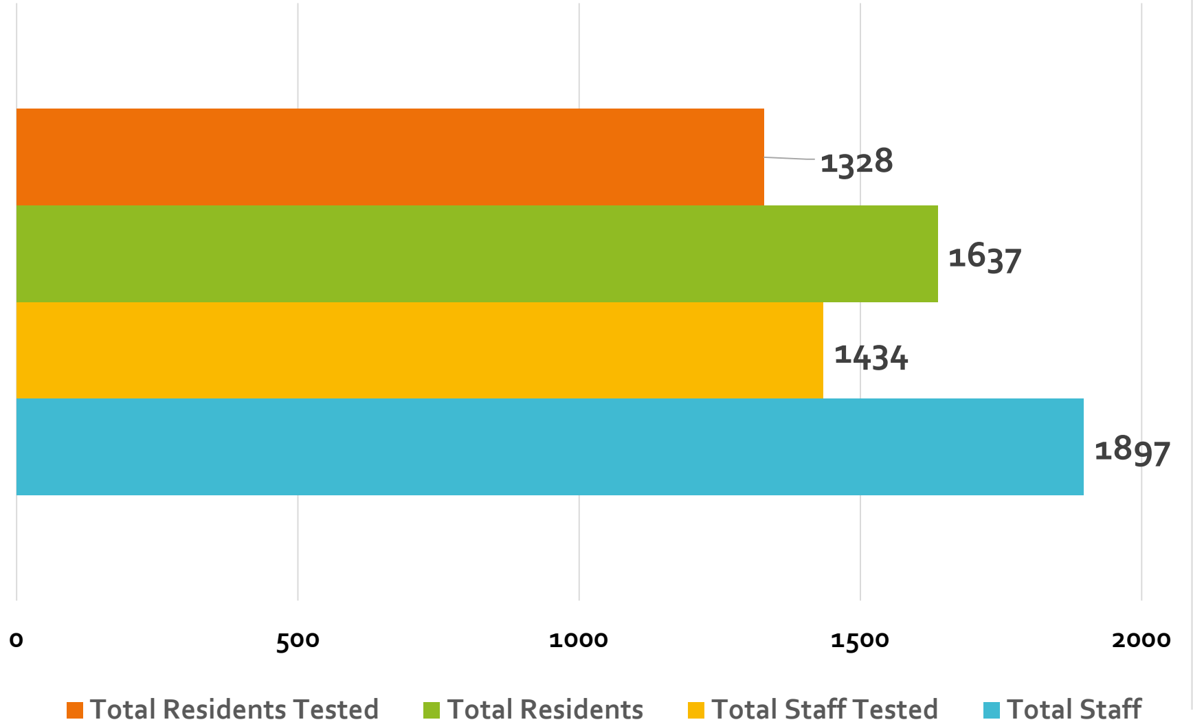
LTCF Strike Team Testing Data April-September